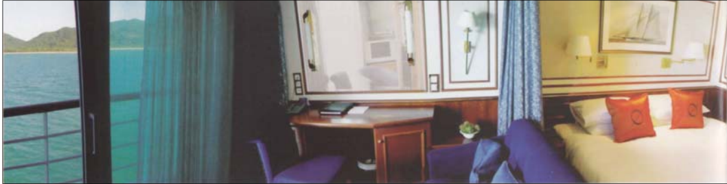
BS - French Balcony Suite Floor to ceiling sliding glass door & small outside area for viewing, shower in bathroom. Deck 5