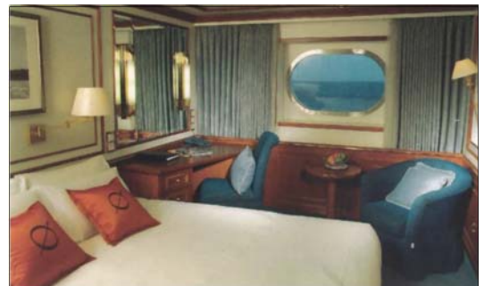
A - Oceanview Stateroom Large oval windows or twin portholes, shower in bathroom. Deck 3 (our group staterooms)