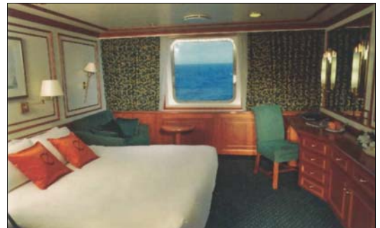
JS - Junior Suite Large rectangular or large oval windows, shower in bathroom. Deck 4 (our group Suites)