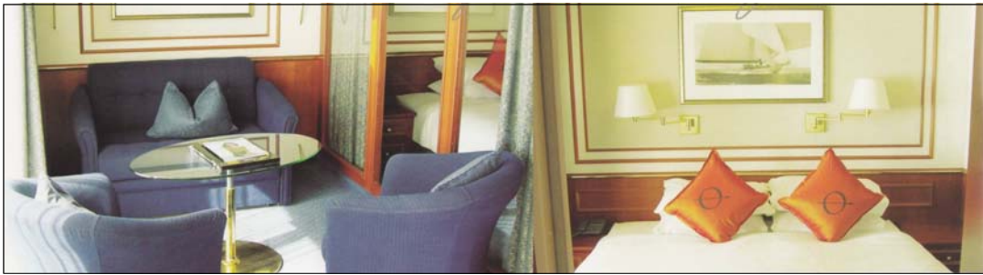
OS - Owner's Suite With French Balcony, sitting room, separate bedroom and marble bathroom Deck 5